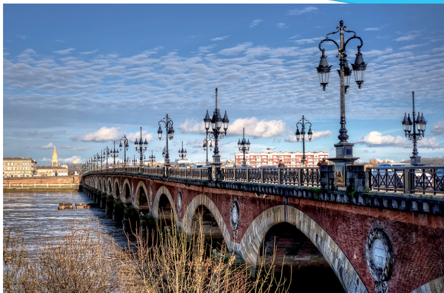
The Stone Bridge on the Garonne, Bordeaux.

For the organization team , SCI, FFTT, Bordeaux City, Sports Complex,... our goal will be to communicate continuously , in order to fulfill the directives of the SCI, to follow each step of the preparation and to be able to modify and adjust quickly and efficiently any part of the events.