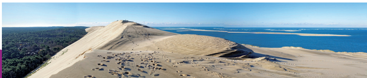
The famous Dune of Pilat.

As part as the extra activities, a gala dinner will be organized with typically French entertainment and dancing.