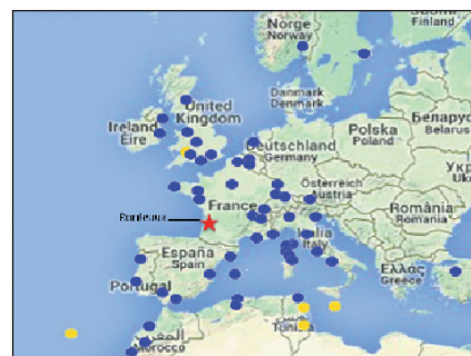
International Flight Connexion

The website will be optimised for these requests, in order for the participant to select the date, hotel, flight... then to receive quickly a quotation and to book their trip in one shot.